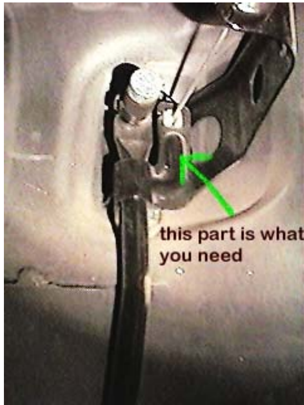
Photo of upper part of the gas pedal. The J shaped bracket has to be present. If this is not, you would need to replace the gas pedal with a later model one.