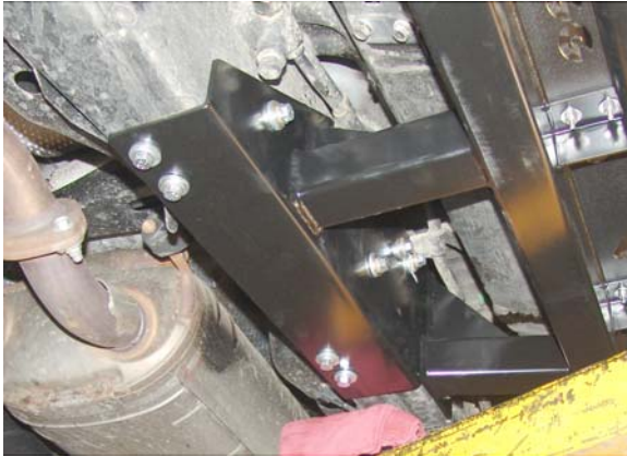
DS Rear bracket showing bolts installed.