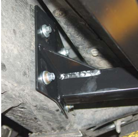
PS front bracket with bolts installed.