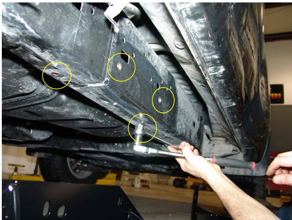
Rivet nut locations on PS