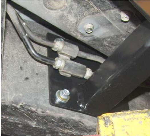
DS front bracket with bolts installed and hydraulic line re-attached. The hydraulic line bracket attaches in the original location using new hardware.

The following photo's are provided as a reference.